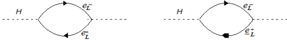
Figure 1: Traditional (LHS) vs Supplemental (RHS) Higgs Mass Radiative Corrections

Focusing on terms in (32) where l=1 (i.e., only the electron family), consider the Higgs mass radiative correction interaction of Figure 1 where in the RH sub-diagram, we introduce a pentagon symbol to represent a supplemental particle trajectory and underlining for supplemental particles themselves.